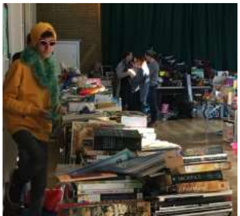
Cool Jake in dressup...

volunteers and the sterling work of the Explorers had everything sorted and ready for perusal when the doors opened – first for traders, then general buyers. Long queues of eager shoppers lined EMC well in advance of the opening time.