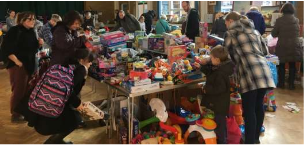
The main room heaving with jumble and keen buyers...