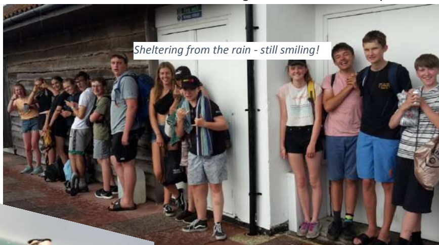
Sheltering from the rain - still smiling!

On the last night there was horrific rain that caused the tarpaulins to leak and sag. Sensing the storm that was about to come some of us migrated to our tents only to be woken at several times during the night as people rushed in to escape from the collapsed mess of hammocks and