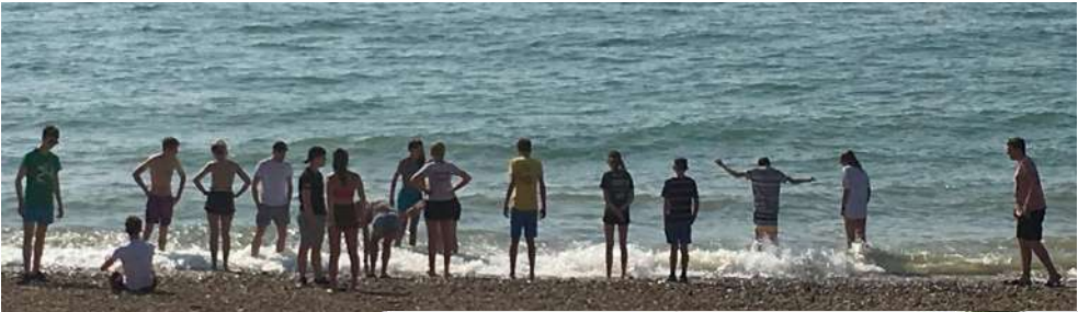
Having a paddle

We went to the Wave Rave at the local swimming pool and followed that with fish and chips on the beach. And we finished off the week with a BBQ on the beach, where even a surprise thunder storm didn't stop our fun!