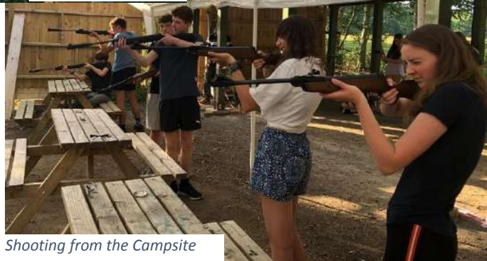
Shooting from the Campsite

campsite during the group to see if they could drag me to the car park without waking me on a the promise of a packet of Oreos if they could. I then awoke halfway through a field to the sound of a leader shouting telling them to drag me back to the trees and threatening to send us all to the tents.