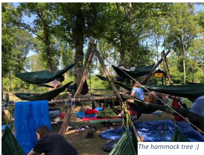
The hammock tree :)

After sleeping in the tents for one night we decided to move to hammocks. Due to the sparsely distributed trees on the site we erected two a-frames and tied hammocks between them and trees.