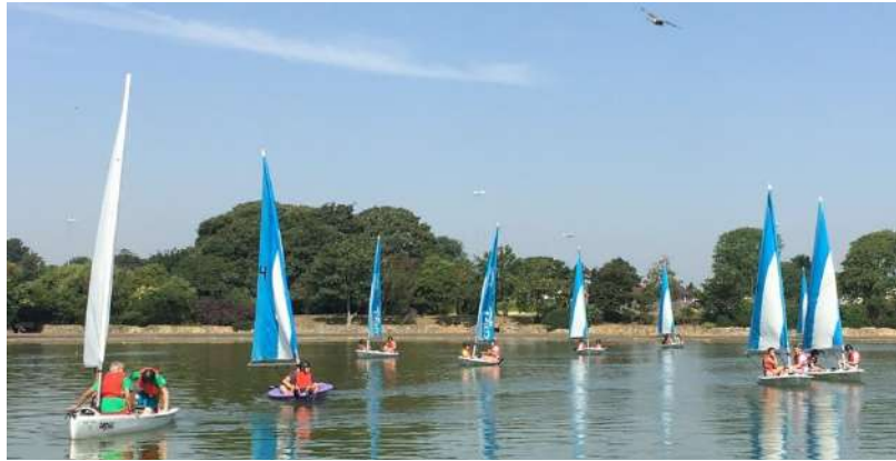
Some might call it a lake but it looked more like an extra large duck pond!!

National Park in 39 degrees heat and cooled off in the afternoon with a game of messy rounders, which led to some of us being coated in a number of things like ketchup and flour. A shower has never been more welcome!