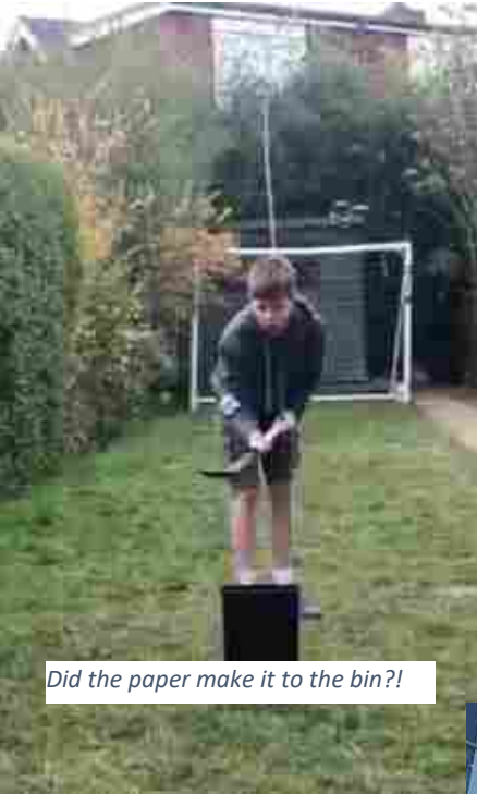
Did the paper make it to the bin?!

Uptake was a bit more this week and included some brilliant and funny edits, from one