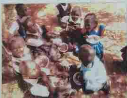
A group of girls having maize and beans for lunch