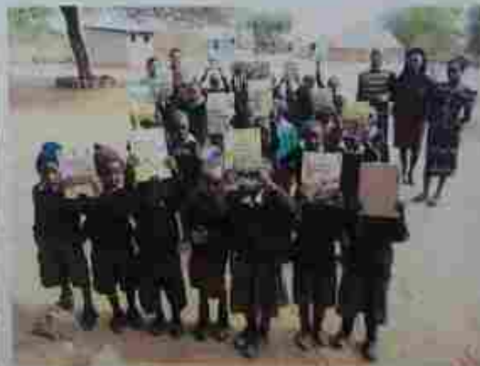
Pupils and staff with new books!