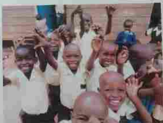
Happy pupils show off small toys they have made