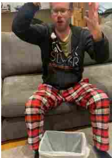
Yes those trousers made another appearance!