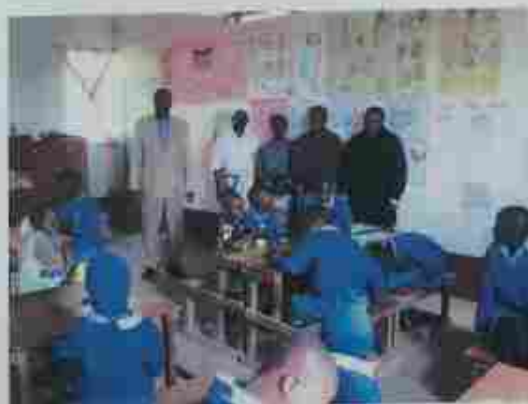
Pupils and staff in a classroom at Thinu Special School