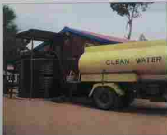
Delivery of water to fill the tanks at Thinu Special School