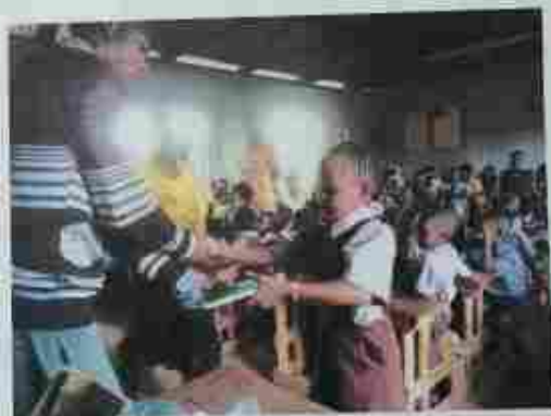
Prize giving at the end of term