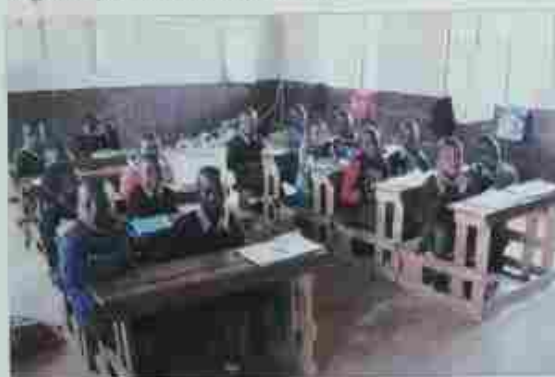
Pupils in class at Kalulini School

Working with our local partner organisation, Rescue Team, in a remote location of eastern Kenya we have recently built a much-needed nursery school for local children who previously had no such facility. Your donation has greatly assisted with the recent development and running of the school, providing a new kitchen building, text books and contributing to salaries for teachers when the parent contributions didn't quite meet the needs. The pupils, many of whom come from incredibly poor families, have thrived at the new school. In addition to academic learning, the safe, caring and fun environment has seen them grow in confidence and self-esteem. As they leave the school to progress to primary, they are reported to be amongst the most confident and highest performers in year one!