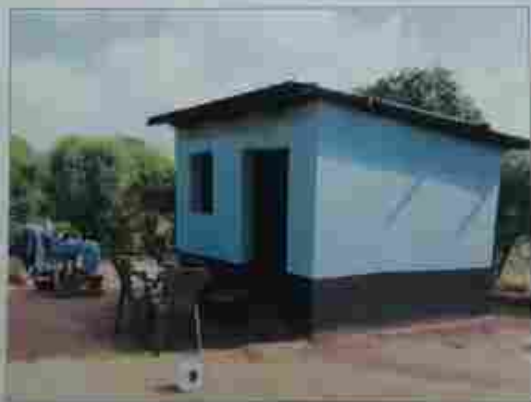
The new school kitchen