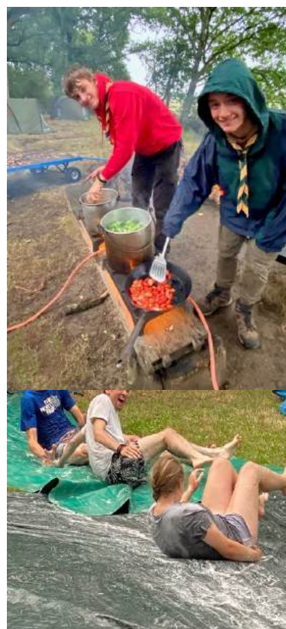
21 Explorers were alert enough to beat the rush and get themselves a coveted