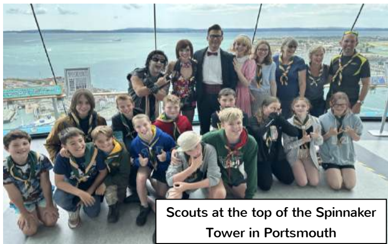
Scouts at the top of the Spinnaker Tower in Portsmouth

setting up, and then we spent the rest of the week trying to dry things out. Another bout of constant rain in the middle of the week didn't make things any easier. However, the Scouts showed their true colours and were stoic through all the challenges.