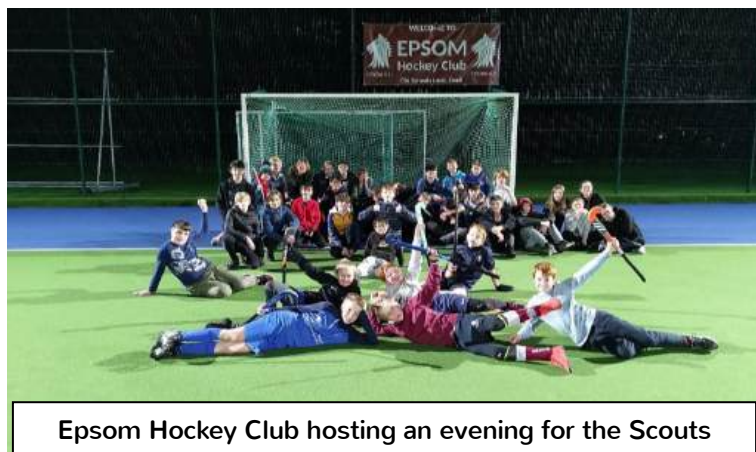
Epsom Hockey Club hosting an evening for the Scouts

most of the camps. My hope is that Scouts are proud of all the badges that they receive, recognising the hard work that has gone into them from the Leaders and themselves. Even though most Scouts will not complete their Gold Chief Scout Award, they should wear every badge that they receive with pride. During their four years with us our hope is that they will have fun on their Scout journey, and remember the promise that they made when invested 'to help other people', and to keep the Scout Law.