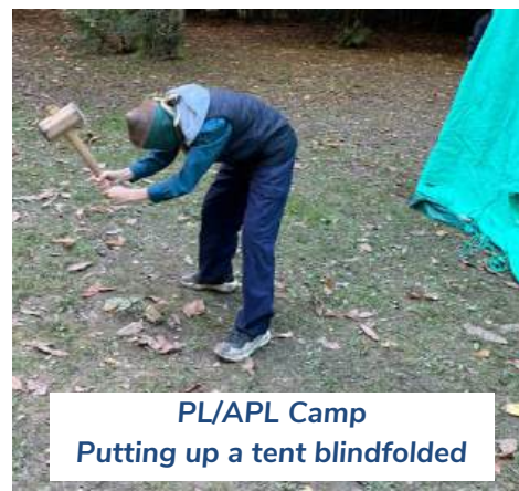
PL/APL Camp Putting up a tent blindfolded

Spring Camp was a 7 th Epsom Group camp with Beavers, Cubs, Scouts and Explorers. Bentley Copse was a great location with lots of activities that all members of the group