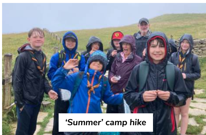
'Summer' camp hike

Summer camp at Buddens included some highlights of travelling to Brownsea Island on the ferry, going to the tank museum, visiting the towns of Swanage and Wareham. However, the scouts will probably remember for a long time our coastal hike on the Thursday which was one of the wettest hikes I can ever remember. We had driving rain along the coast and were soaked to the skin. The showers and hot drinks were most welcome when we returned to camp. Luckily the Friday saw bright sunny weather and we were able to dry the tents and a lot of wet clothes.