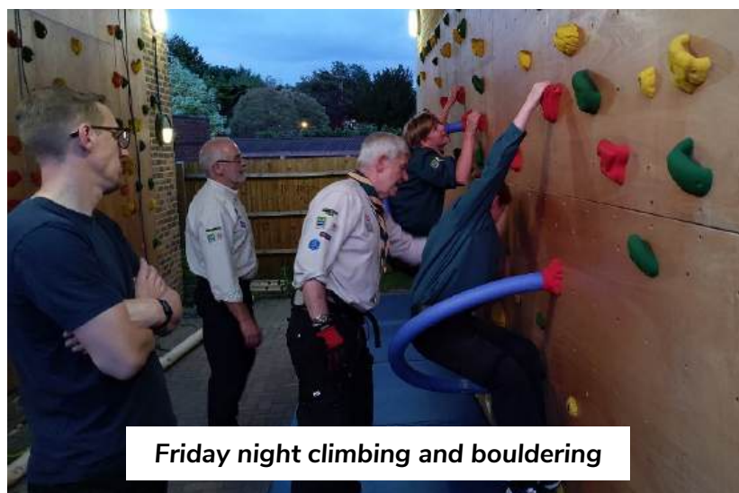
Friday night climbing and bouldering

We are very keen to welcome some more adults to join the team as the current team is not getting any younger. Scouting has been a major part of my life, and has given me great joy, and a lot of fun and friendship. If there are any parents, friends, grandparents out there who would like to be involved please do get in touch. You don't have to commit to every week, but offering to be part of the team would make a massive difference to our planning going forwards.