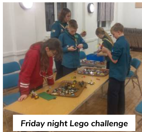
Friday night Lego challenge